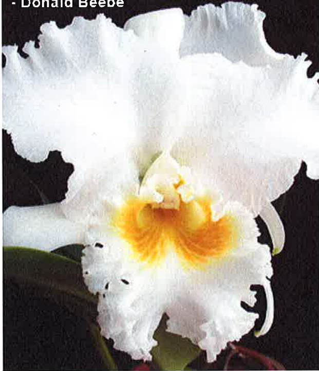
Cattleya Bow Belles 'Anne Chadwick' - Donald Beebe